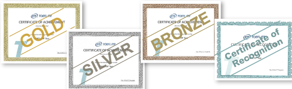
(There are no certificates for TOEFL ITP® Speaking Test)